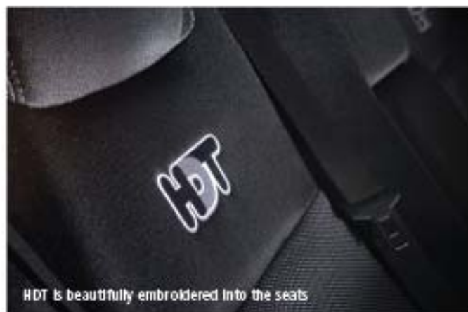
HDT is beautifully embroidered into the seats

GROUP ONE is based on an SV6 Commodore, with its 195kW Alloytec V6 and receives HDT's unique styling, including exterior and interior details, and HDT's Dynamically Enhanced Sports Suspension. The Group One is an ideal choice for those who want the styling and presence of an HDT at an entry level price. It is also ideal for customers with license restrictions, such as those placed on provisional drivers all across the country. Exhaust and tuning upgrades are available for the V6 upon request.